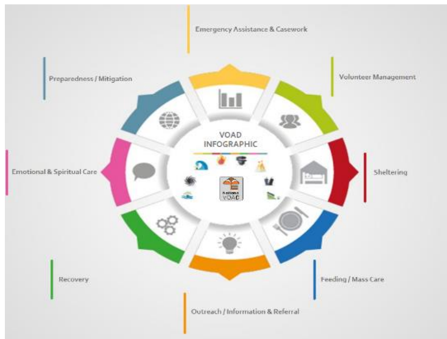
Image taken from "National VOAD: 101," published by Bethanie Greene. https://slideplayer.com/slide/5307107/ .